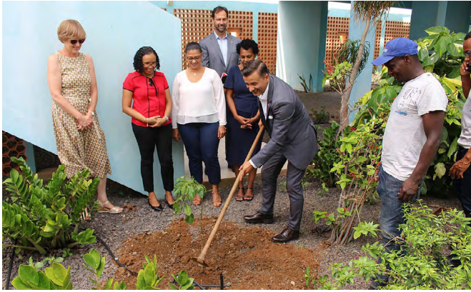
An EXI tree-planting campaign in Cidade de Praia, Cape Verde, involving the German-Portuguese Chamber of Commerce, the German Ambassador to Cape Verde and the local project partner.